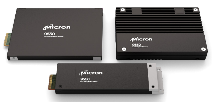
Micron 9550 NVMe SSD

Micron IP and components are fully vertically integrated with Microndesigned controller ASIC, 232-layer NAND, DRAM, firmware, and validation.